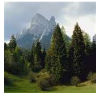
Majestic and glorious