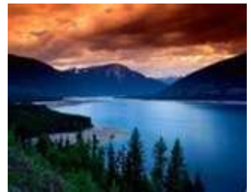
Our beautiful planet

Further elevator interior modernization will continue in September 2010 as we bring our brand new look to the interior of six more elevator cabs.